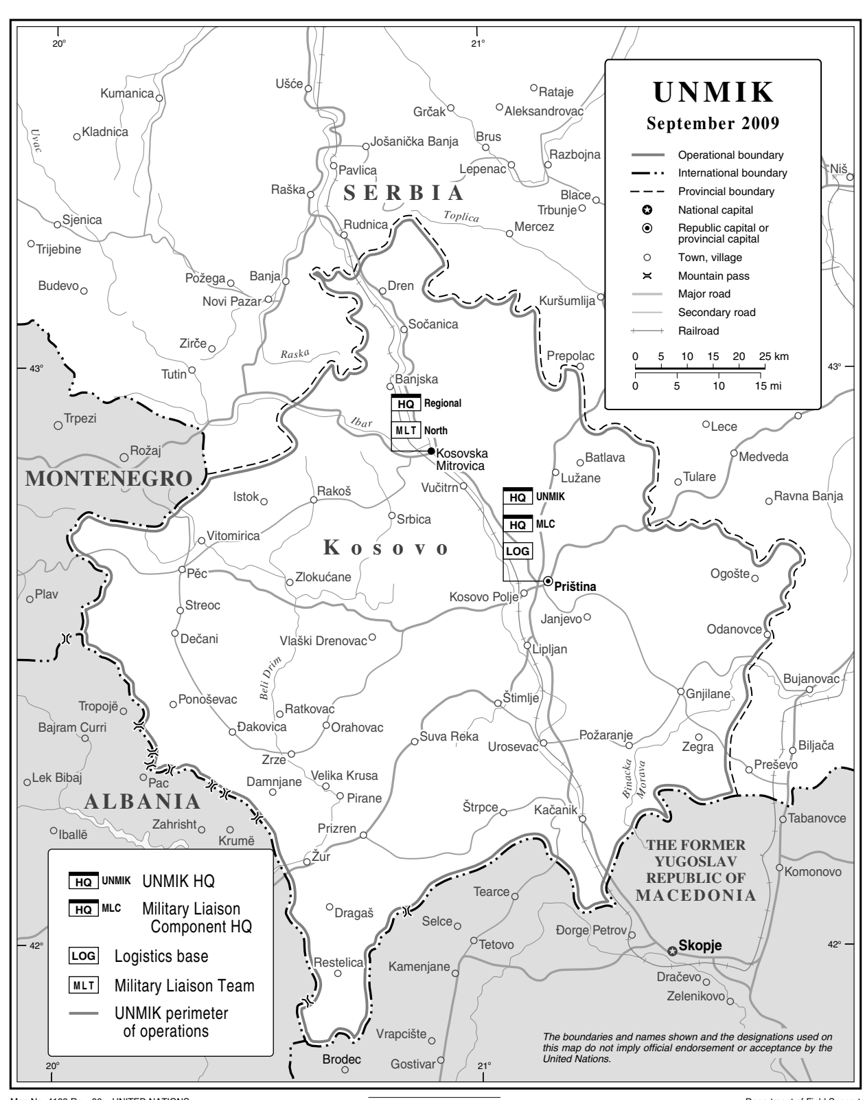
Map No. 4133 Rev. 36 UNITED NATIONS September 2009

Department of Field Support Cartographic Section